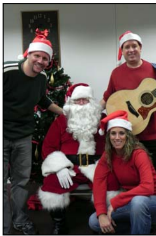
The J&J IT staff from Skillman are ever ready to make it a party, Santa comes along too!

OUTREACH CENTER —Each year, the staff at the Resource Center of Somerset tries to make sure the children who come for services have the opportunity to celebrate the holidays and put aside the stress from living in an abusive situation they face every day.