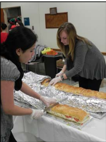
RCS staff members prepare Just Subs sandwiches for the over 125 party guests.