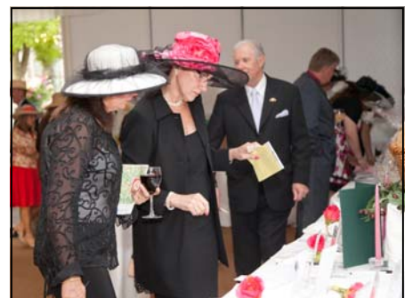
Scenes from Derby Day 2011