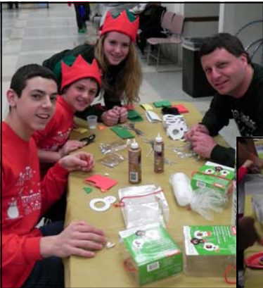
Student Council members and J&J staffers have plenty of crafts and games available for the kids to enjoy.