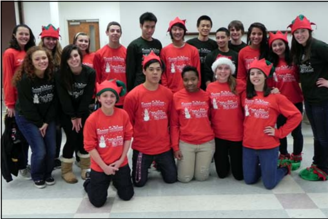
Hillsborough High School Student Council helps organize the party, games and gift giving to make the holidays fun for all the client children who attend.