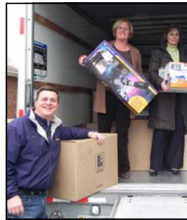
NEW JERSEY 101.5 FM RADIO